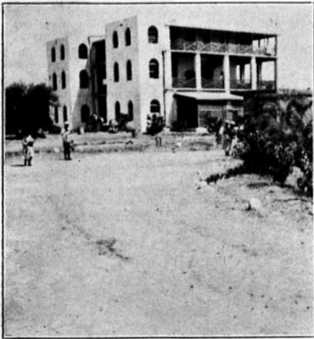
The Ian Keith Falconer Mission Hospital, located at Sheikh Othman, Aden.