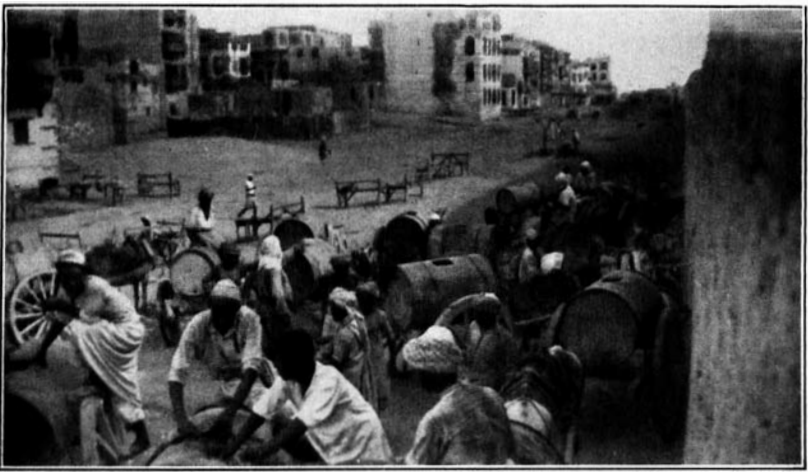
WATER WAGONS, JIDDAH.